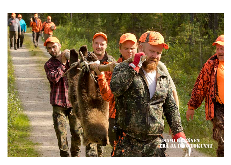
Organisation, communication within hunting team