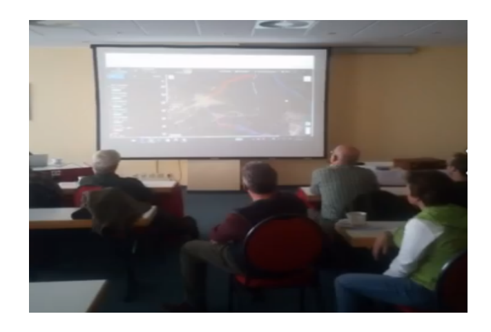
Inevitable evaluation tool for dog exams, competitions