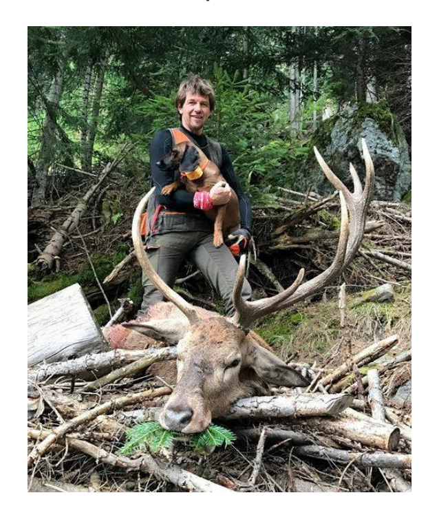
Filed studies and wild-life management project